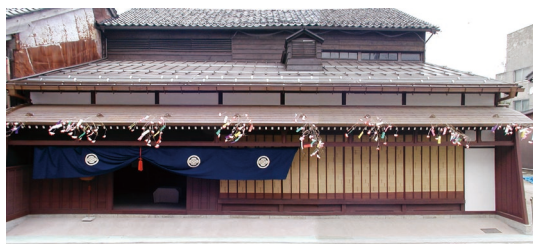
Restoration of the historical architecture