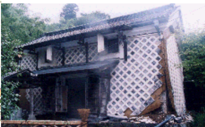
Damage survey of a structure by an earthquake

We're investigating and studying Japanese historical architecture. Main results include the following.