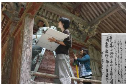
Investigation on an ancient document